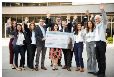
Fig. 3: Donation Check Handout at DS World 2021