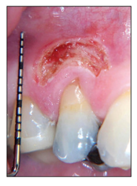
Fig. 2 Immediate Post-Op.

Immediately post operatively, post-operative photographic documentation was acquired and an oral hydrogel wound dressing (SockIT gel, MCMP, LP, Grand Prairie, TX) was applied to the surgical site. The dispenser with the remaining SockIT gel was given to the patient for home use to be liberally applied several times a day, as often as desired, to relieve any discomfort and to minimize microbial activity. Post-operative instructions were given verbally and in writing and the patient was instructed to return for routine hygiene care.