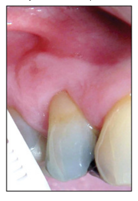
Fig. 3 One-year follow up.

The post-operative discomfort reported by the patient was very minimal. The patient stated that they returned to work immediately after the appointment with no disruptions or limitations in their duties. Additionally, the patient reported that when they had any post-operative sensation it was completely and immediately eliminated with the application of the SockIt gel.