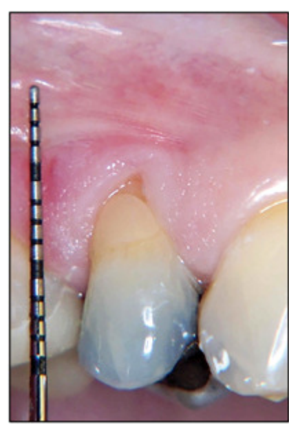
Fig. 1 Pre-Op.

In the adjoining case report, the patient presented with some mild recession and an inadequate zone of attached gingiva (1 mm) and periodontal sulcus of 0.5 mm on the facial aspect of the maxillary first premolar (Fig 1) .