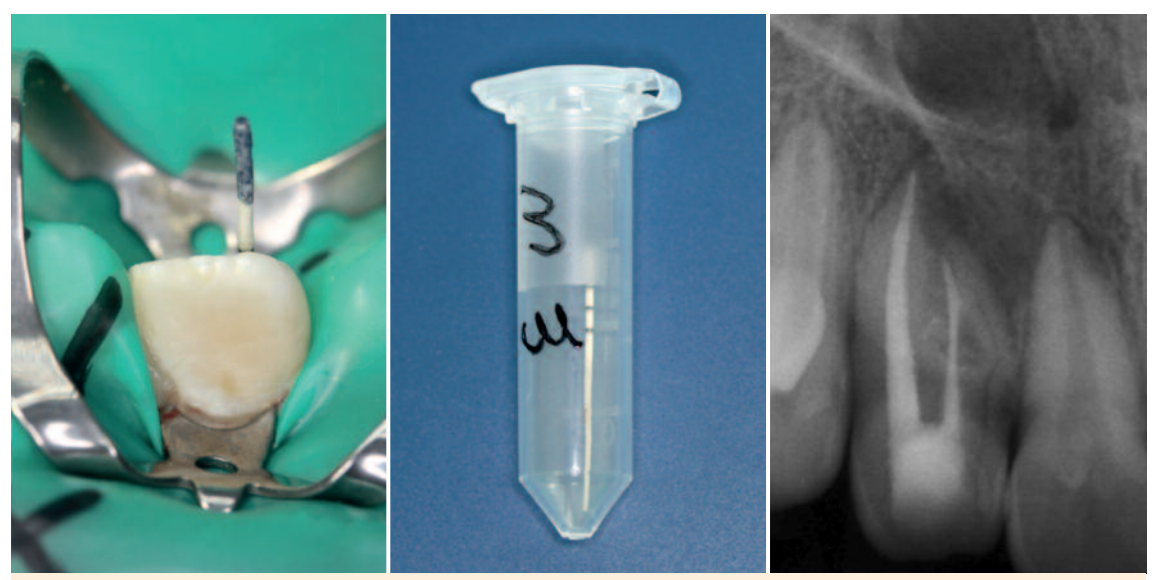
Fig. 10: Microbiological sampling after laser irradiation of the inner canal walls with a sterile paper point. – Fig. 11: Paper point prepared for transporting for real-time PCR analysis after removal from the treated root canal system. – Fig. 12: Follow-up X-ray image after root canal filling. Compared to the original image, a tendential decrease in the apical change is noticeable.

During the final treatment session, no blood or secretion discharge from the canal system was observed after removal of the temporary root canal dressing. A suspected resorption lacuna in the middle area of the mesial canal on the basis of the radiological image was not clinically evident during probing of the canal walls. Therefore, a gutta-percha root canal filling was carried out with vertical and horizontal condensation using the MTA Fillapex sealer based on a mineral trioxide aggregate (Angelus, Londrina, Brazil) without a thermoplastic root filling technique. After a radiological check-up of the root filling (Fig. 12), the root canal openings were sealed (SDR, DENTSPLY DeTrey, Constance, Germany) with an adhesive technique (AdheSE, Ivoclar Vivadent, Schaan,