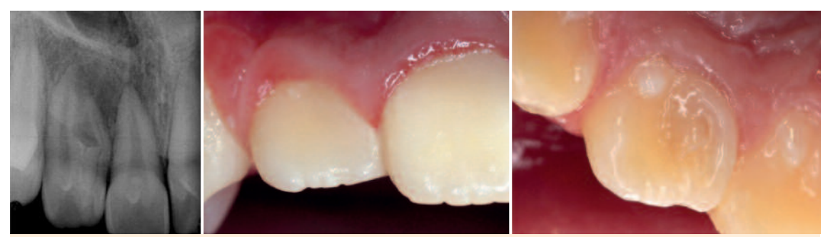
Fig. 1: X-ray of tooth 12 before treatment. A geminated tooth with two distinctive root structures is evident. Furthermore, internal resorption was suspected. – Fig. 2: Clinical picture of tooth 12 after systemic antibiosis by the previous dentist. The vestibular view does not show any signs of an endodontic-related acute inflammatory event. – Fig. 3: Clinical picture of tooth 12 from palatal. The partially irregular morphology of the tooth crown indicates the formation of a geminated tooth.

In the process, over 95% of the microorganisms in the endodontium can be eliminated.<sup>4</sup> Even though many methods and rinse solutions for chemical preparation are available, sodium hypochlorite in a concentration of 0.5–5% is still recommended as the first choice. In order to further improve germ reduction in the root canal, adjuvant antimicrobial procedures may also be used. This includes the use of laser energy, which can be performed athermally (e.g., as part of photodynamic therapy) or thermally. The antimicrobial properties of laser systems such as the diode laser are principally based on thermal effects. In this regard, a 980 nm laser is ascribed as having an antibacterial effect which can be demonstrated up to the depth of dental hard tissue.<sup>5</sup>