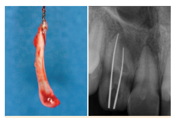
Fig. 5: Removed pulp tissue from the sensitive distal root canal of tooth 12. – Fig. 6: Silver point image for radiologically assisted determination of root length and canal pathway.

At the following treatment session, the two root canals looked different after removing the temporary protective filling. While there were no noticeable problems distally, mesially there was slight blood and secretion discharge. After rinsing the canal system with a 2.65 % solution of sodium hypochlorite, a microbiological sample was taken using sterile paper points. Laser irradiation of the inner canal walls was then carried out for one minute each by moving a laser fiber from an apical to coronal direction. For this, the class IV SIROLaser Advance (Sirona, Bensheim, Germany) 970 nm